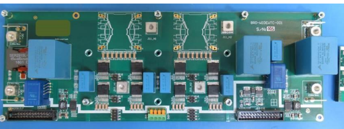
to final application